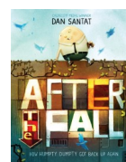
By: Dan Santat